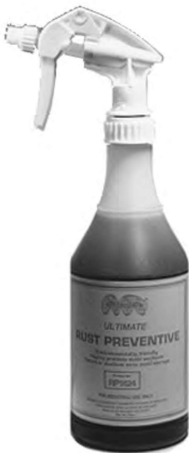
• 24 oz. bottle