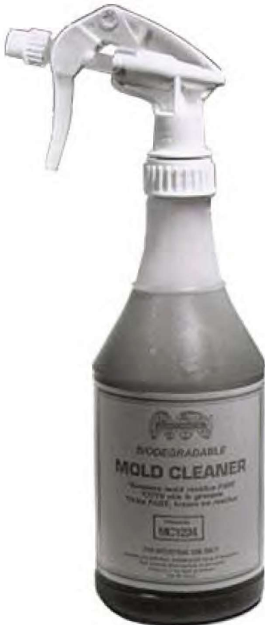
• 32oz. Bottle