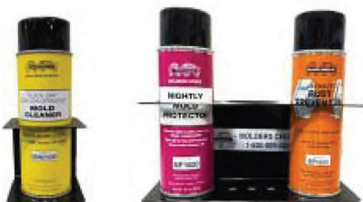
Three sizes – 1, 3 or 6 cans